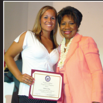
...Con't. on page 4 - Pride

The men's soccer team captured the 2005 Far West Regional title last season with a thrilling 2-1 overtime victory over then No. 5 Seattle